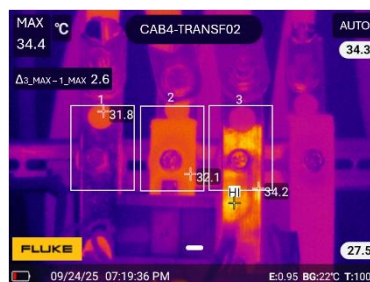
Automatic 3-phase maximum temperature difference calculation with one-click

With built-in route inspection function, pre-set inspection routes help track inspection progress in real-time to avoid missed inspections. This offers a new digitised option for scenarios where QR codes do not work.