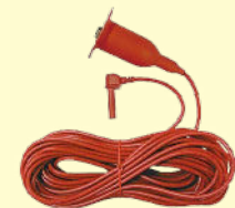
7253 Longer line probe with alligator clip(15m)