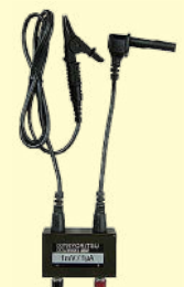
8302 Adaptor for recorder (Output 1mV/1μA)