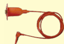
7168A Line probe with alligator clip(3m)